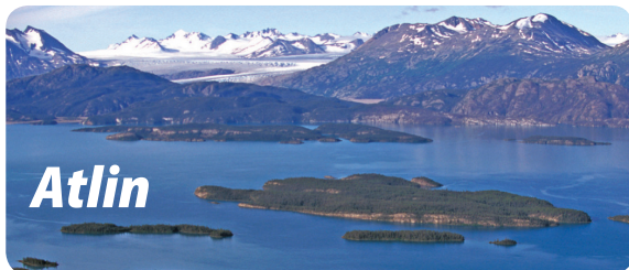
Atlin Lake Aa Tlein