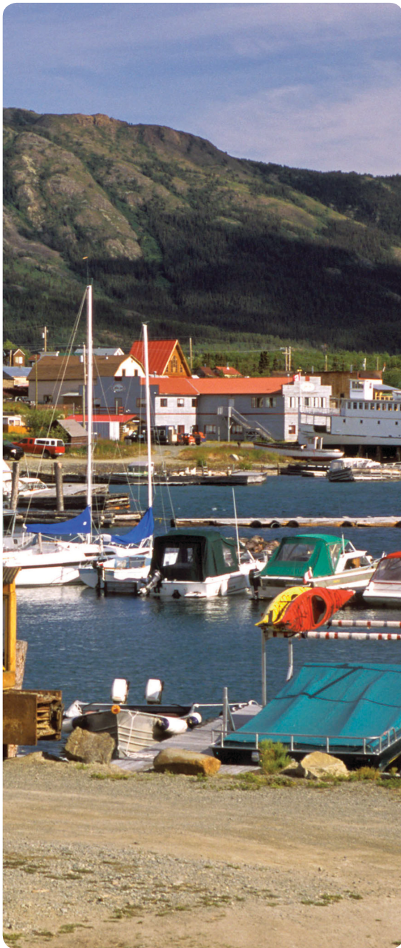
Atlin, British Columbia