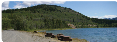
Como Lake Recreation Site

Access: Located approximately 3.7 km south of Atlin along Warm Bay Road. The parking area is located 1.2 km south of the Pine Creek campground. The trail head is just across the road.