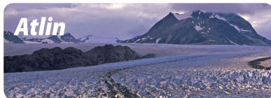
Atlin Provincial Park — Llewellyn Glacier

Recreation Sites and Trails BC, BC Parks and the community of Atlin offer a range of excellent summer recreational and tourism opportunities throughout the Atlin area. Enjoy the many opportunities for hiking or mountain biking on historic gold mining roads and wilderness trails.