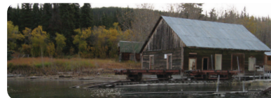
Shortest Railway Trail — Taku City Rail Station